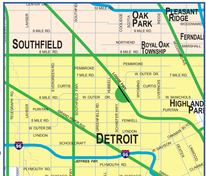
Location - Value - Service

TOTAL WEEKLY IMPRESSIONS: 257,221 SIZE: 14' x 48' with 8'7" Side | SIDE: West | FACE: South LAT: 42.422968 | LONG: -83.178662