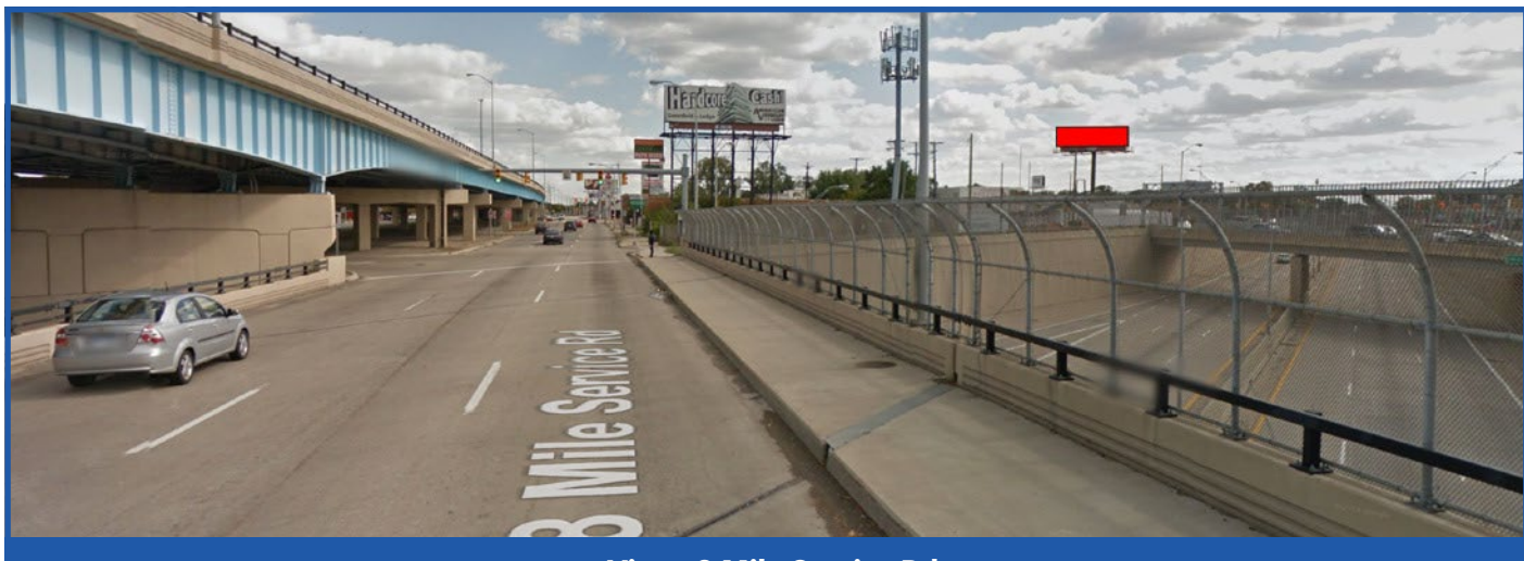
View: 8 Mile Service Rd.