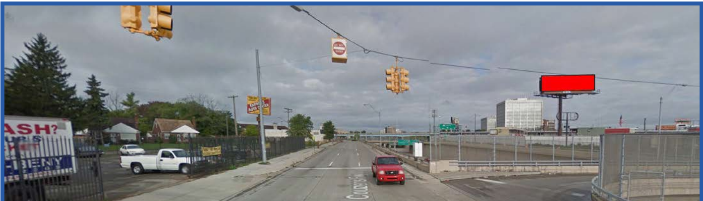
View: Lodge Fwy. Service Drive