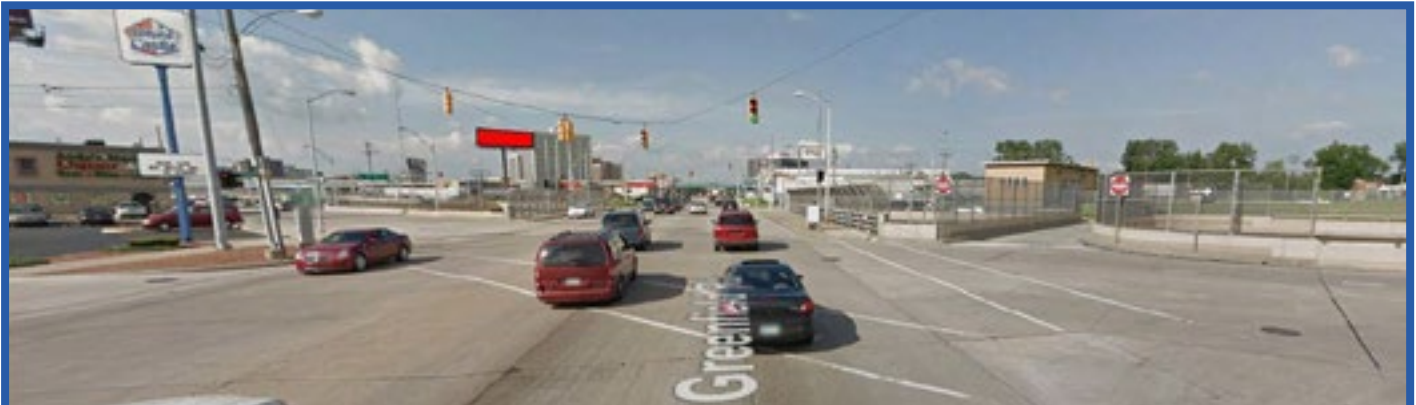
View: Greenfield Rd. Traveling North