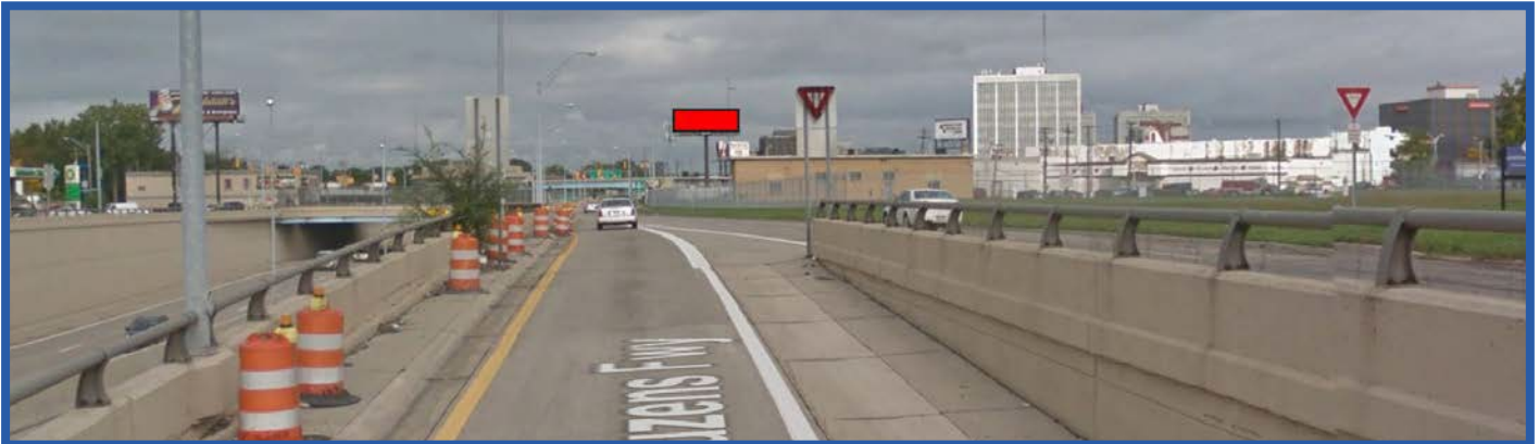
View: Exit Ramp 8 Mile Rd. & Greenfield Ave.