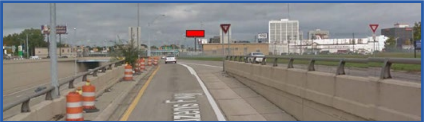
View: Exit Ramp 8 Mile Rd. & Greenfield Ave.