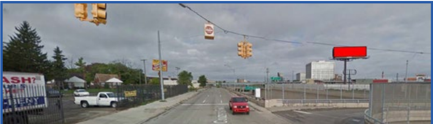
View: Lodge Fwy. Service Drive