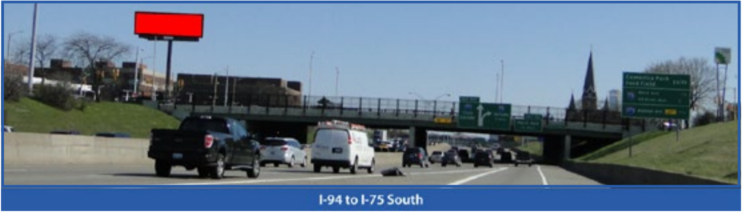
I-94 to I-75 South