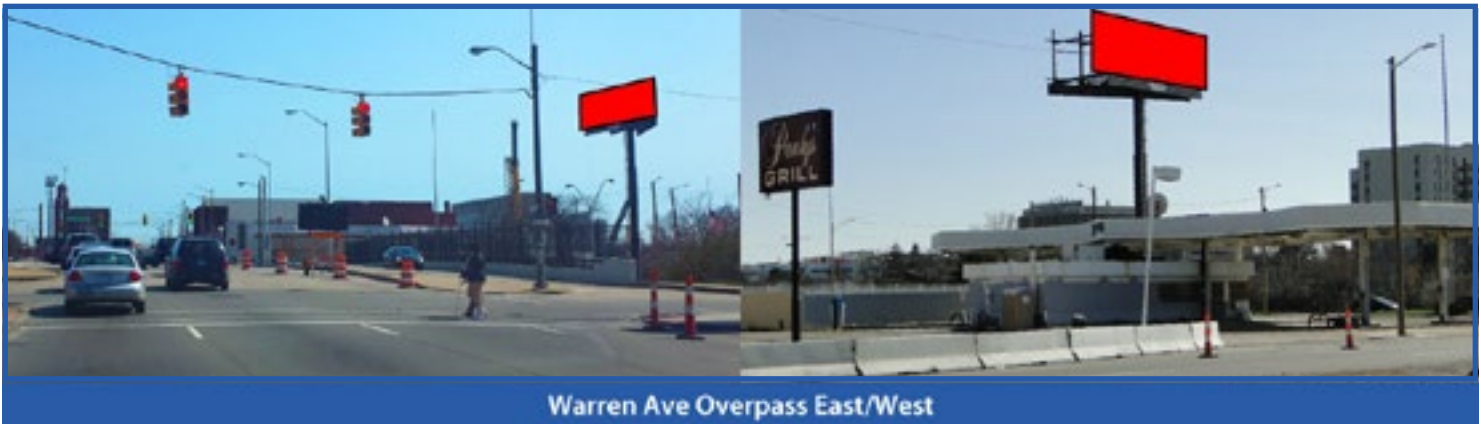
Warren Ave Overpass East/West