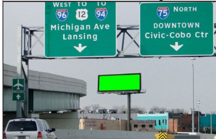
View: Entering from the Ambassador Bridge