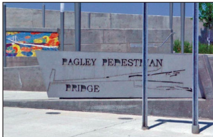
View: Pedestrian Bridge