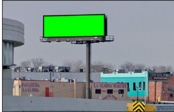
View: Entering I-75 North, I-96 & I-94 from the Ambassador Bridge