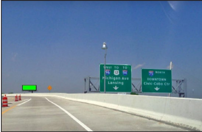
View: Entering South the Ambassador Bridge