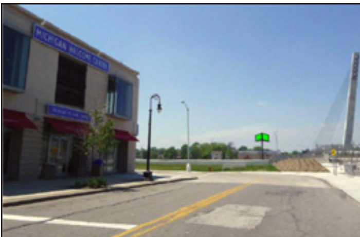
View: Michigan Welcome Center & Bagley Pedestrian Bridge across freeway from billboard, Both sides of billboard are