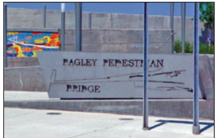
View: Pedestrian Bridge