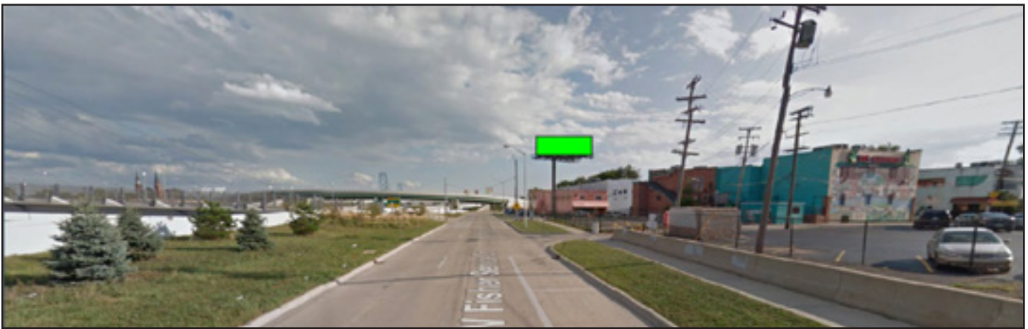
View: Fisher Service Drive