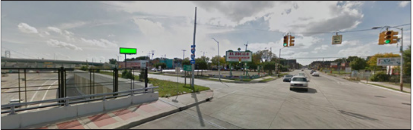
View: Vernor Hwy