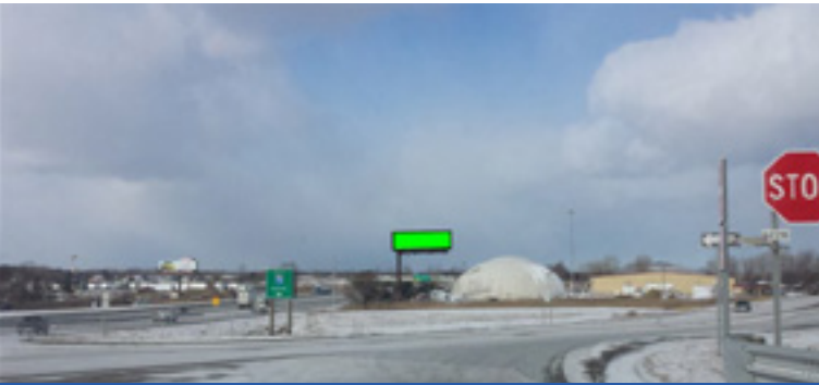
Bonus View: I-75 Exit Ramp

KEY ATTRIBUTES: Excellent location on I-75 heading from a large Downriver community towards the greater Detroit Area. Commuters are traveling towards the heart of Downtown Detroit, home to GM Headquarters, sports arenas, central business district, and theaters. This is en route to the greater Detroit area which connects to other highways that lead to both the desirable Macomb and Oakland counties.