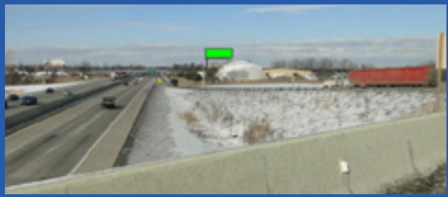
Bonus View: Dix-Toledo Rd.