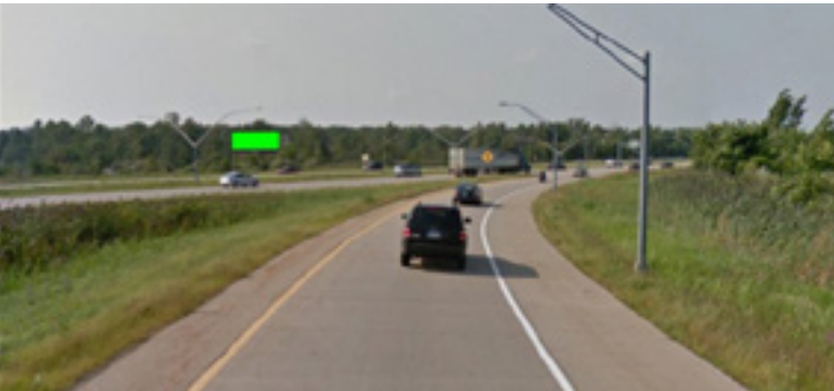
Bonus View: Entrance Ramp North Bound to I-275

KEY ATTRIBUTES: This first impression, first billboard is viewable on the I-275 freeway which heads to I-94 as well as Western Wayne County and Oakland County to communities such as Canton, Plymouth, Northville, M-14, Novi, I-96 Fwy, and more. There is also a direct view to commuters leaving Metro Detroit Airport's west entrance. This board is in an area of light and heavy industrial businesses and reaches a huge blue-collar working demographic. Key attractions include: Romulus Athletic Center and The Romulus Historic Museum which are just minutes away.