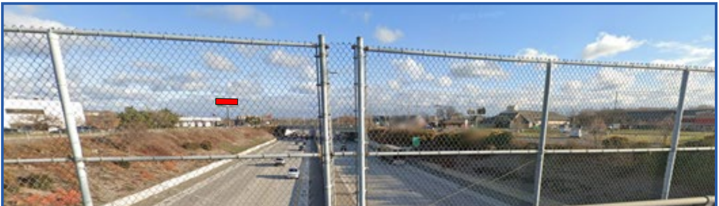
I-696 WB overpass to I-696 EB service drive