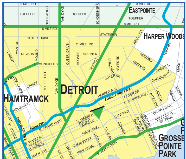
Location - Value - Service

TOTAL WEEKLY IMPRESSIONS: 134,095 SIZE: 14' x 48' (illuminated) | SIDE: West | FACE: North LAT: 42.389808 | LONG: -82.978369