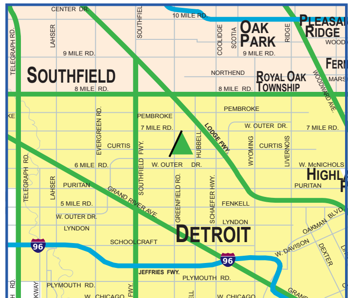
Location - Value - Service

AGES 5+ WEEKLY IMPRESSIONS: 191,839 SIZE: 14' x 48' (illuminated) | SIDE: South | FACE: West LAT: 42.430211 | LONG: -83.198939